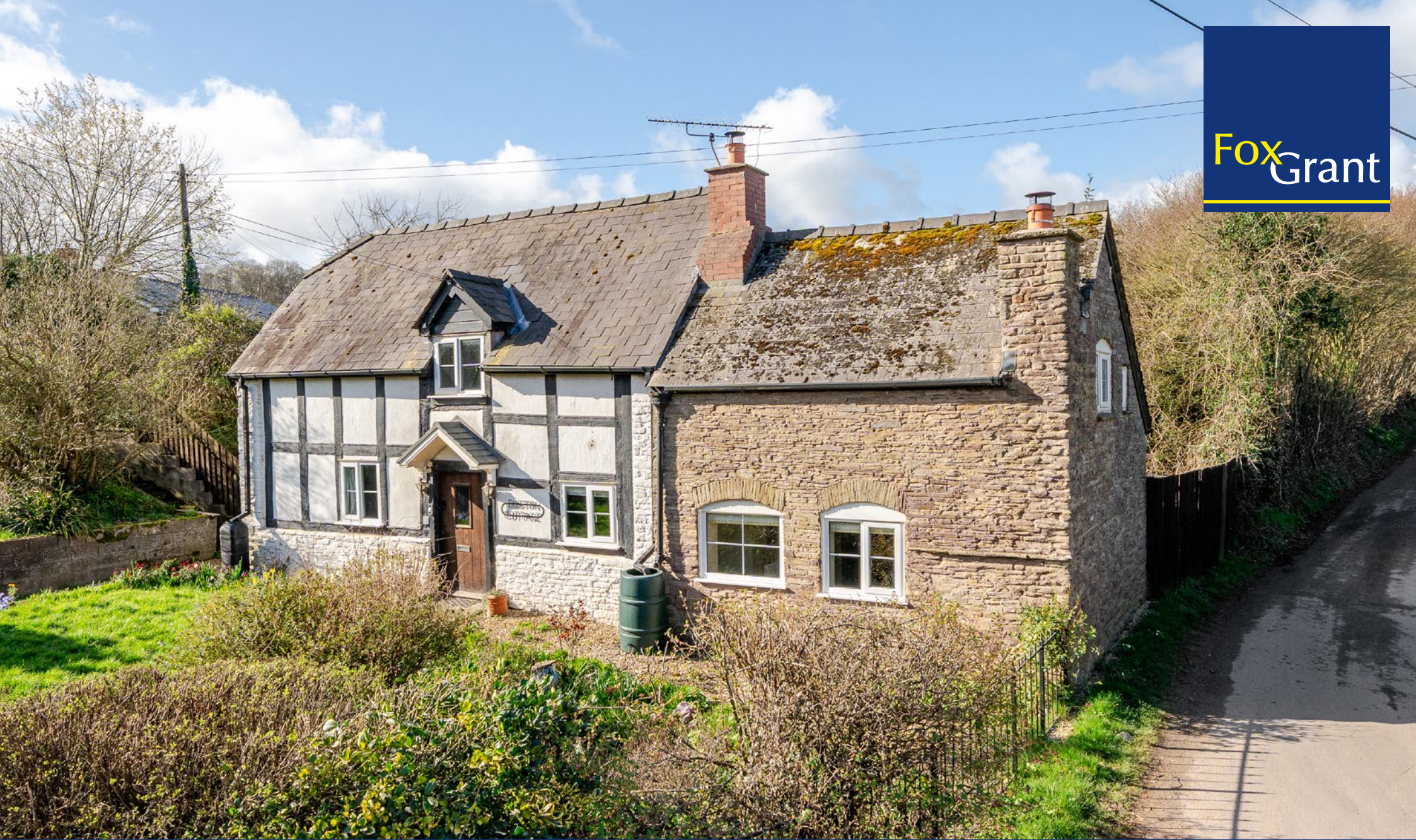
BOSTON COTTAGE, PETERCHURCH, HEREFORDSHIRE, Charming Cottage Enjoying Rural Village Location with Equestrian Facilities.