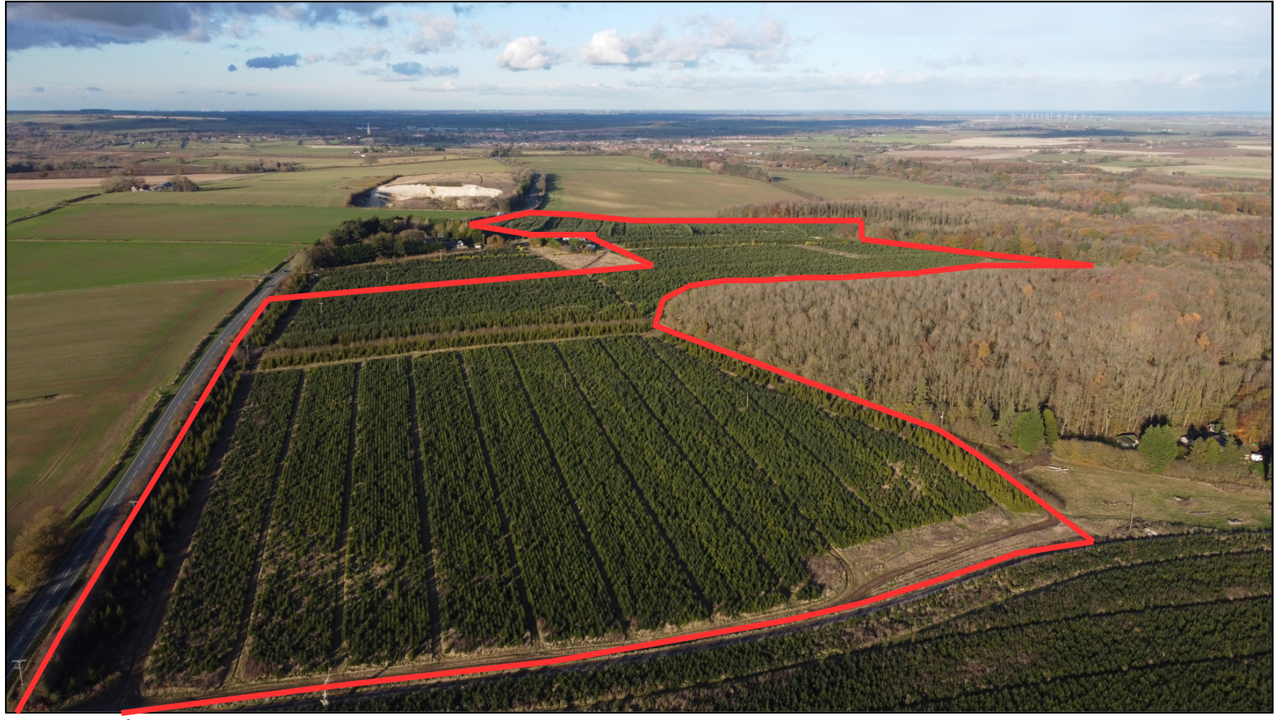
Lot One (edged red above)

Lot One comprises circa 82.88ac (33.54ha) (STS) or thereabouts of good quality Grade 2 agricultural land positioned in a large block directly east off the A16 at Tathwell. Approximately four field parcels make up the block and all benefit from internal tracks. The soil is of the Tathwell Series and comprises base rich loamy, highly fertile soils.