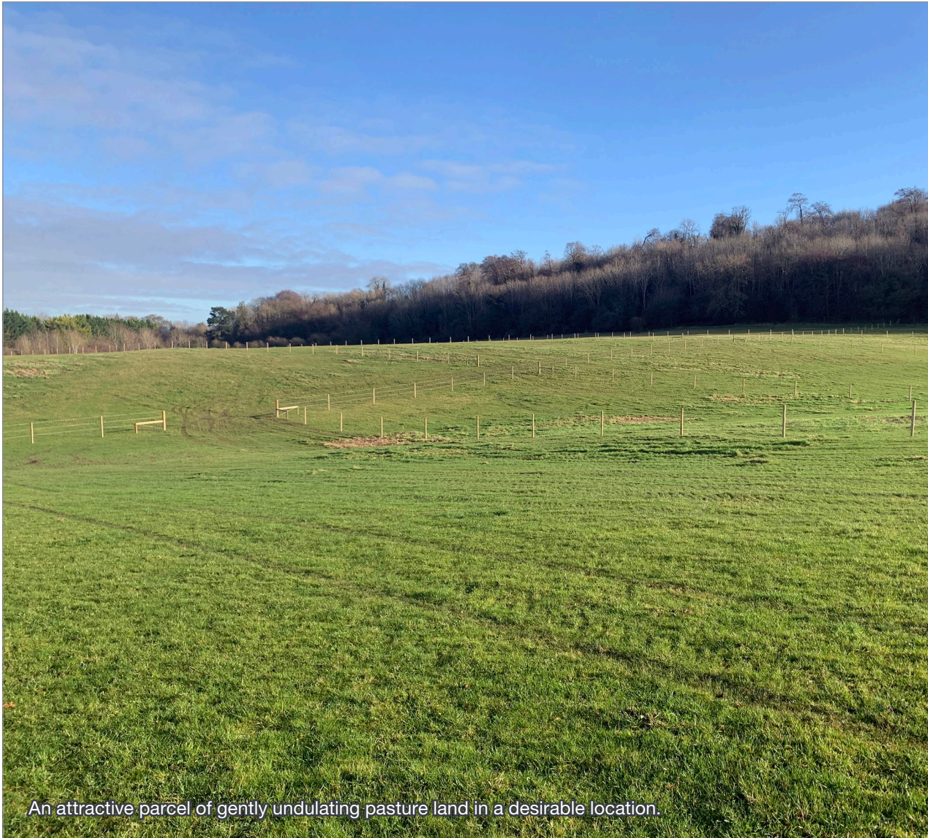
An attractive parcel of gently undulating pasture land in a desirable location.