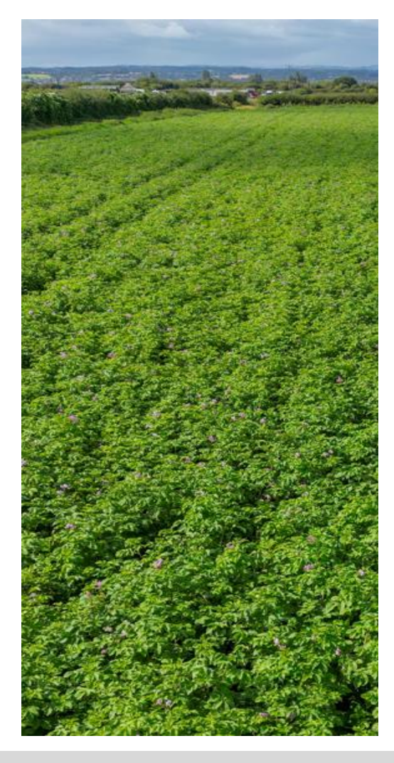
78.52 acres of land at Morriston Farm, Sealand, Flintshire, CH5 2LH For Sale in three lots or as a whole by Informal Tender