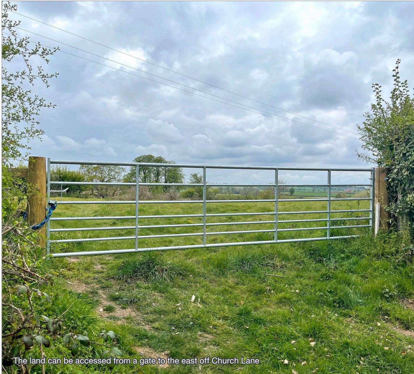
The land can be accessed from a gate to the east off Church Lane