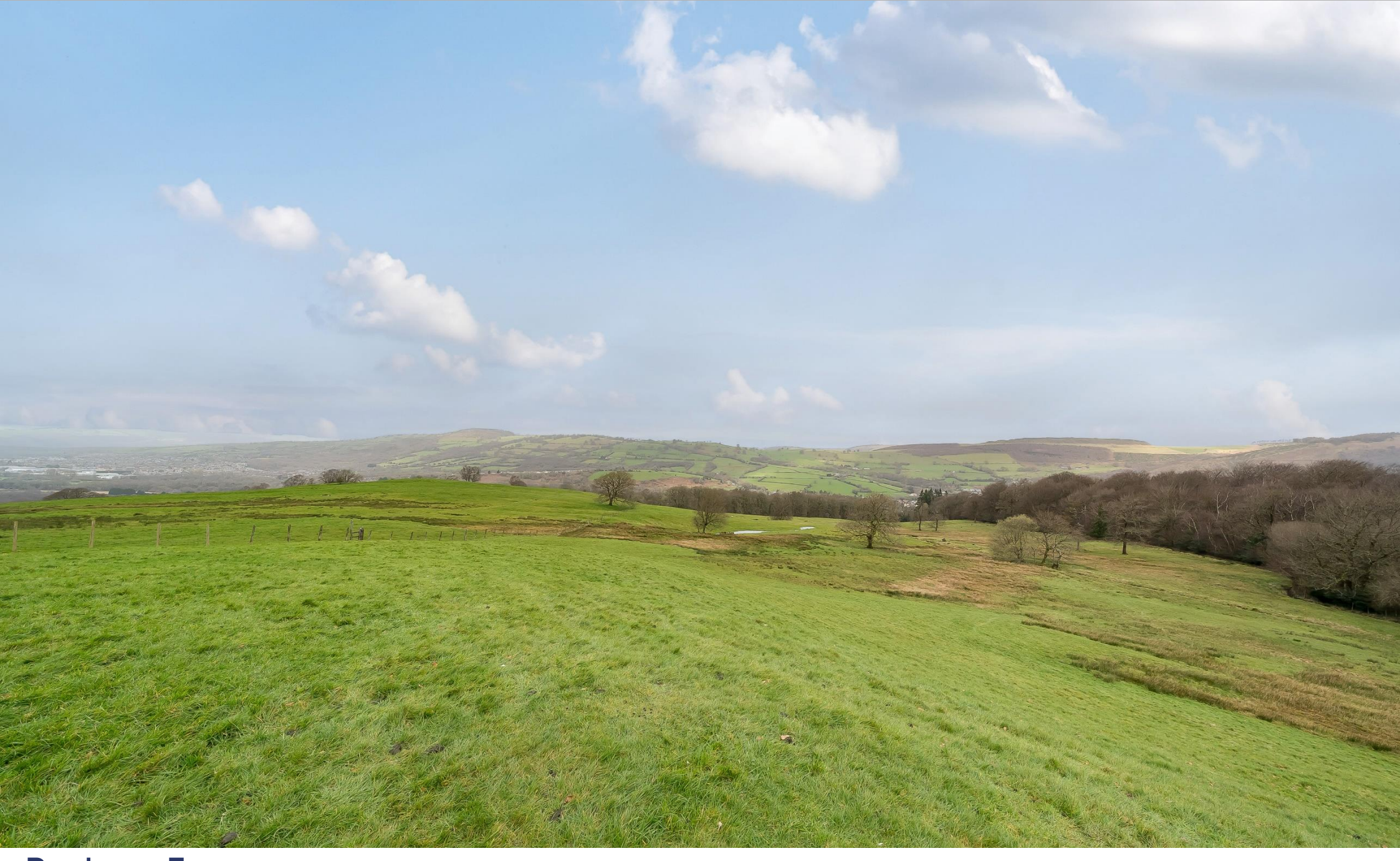
Penhow Farm, Rudry, Caerphilly, CF83 3EB